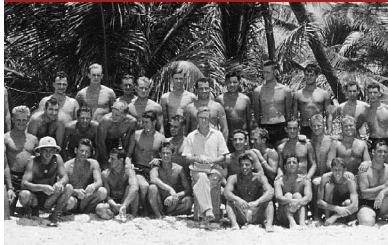
This photo of the Duke of Windsor with members of the Operational Swimmer Group II was taken in the Bahamas in 1945. For more information, please see page 74.

Kunming, China: Setting for Daring Wartime Operations